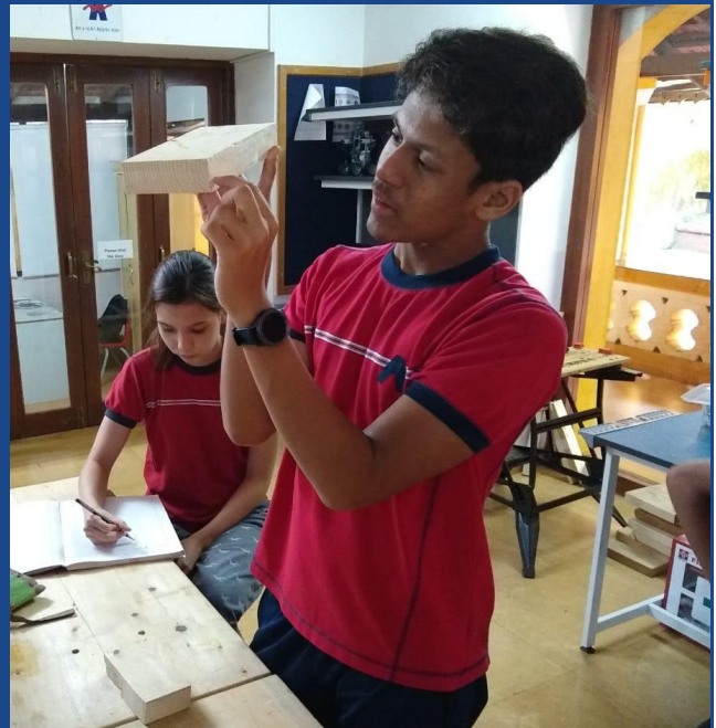
Students from different year groups working on their radios