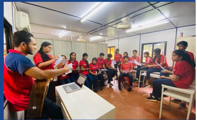
Practicing the group song along with the mentor