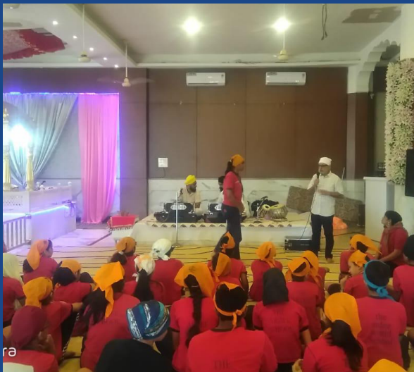
Visit to the Gurudwara. The concept of monotheistic religions was explained, prasad was given and the foundations of Sikhism covered.