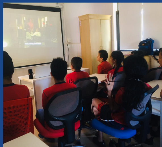
Students watched a televised version of one of Tagore's short story. The experience helped the children relate to the text by watching the visual.