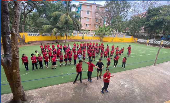
Flash mob practices underway