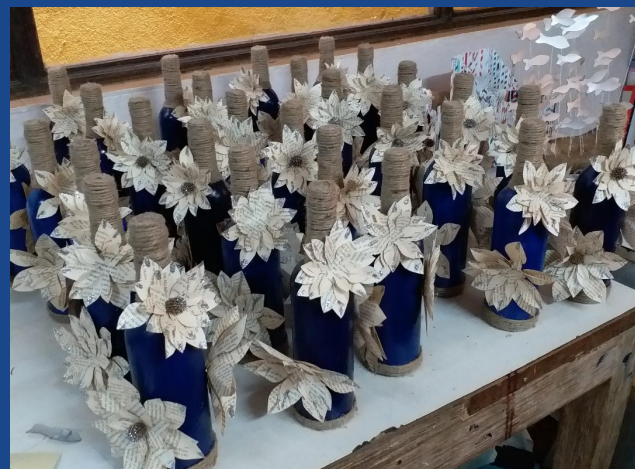
Art & Craft items done by our staff and students