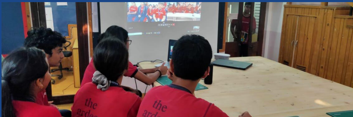
Ed Talk: Students discussed their recent school excursions.