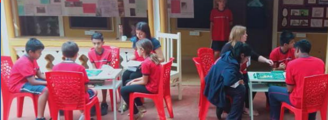
Scrabble competition held in school. Students from years 6 to A levels participated in the same.